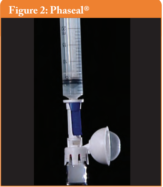
By Carmel Pharma

Filter venting systems, i.e. Tevadaptor<sup>®</sup>/Onguard<sup>™</sup> and Chemoprotect<sup>®</sup> spike, were consistently releasing similar and clearly visible smoke during all tests, with both vial sizes (see Figures 3 and 4). There were negligible differences in Titanium release severity between the vial sizes. The filter of Chemoprotect<sup>®</sup> spike is clearly visible on one side of the device and the release of Titanium was definitely observed only through the filter. The two filter layers (particle filter and activated charcoal) of Tevadaptor<sup>®</sup>/Onguard<sup>™</sup> are invisible from the outside and are covered by an easily removable housing, which does not affect the device performance. The Titanium test was performed on an additional 5 exposed devices, confirming that the Titanium release occurs only through the filters.