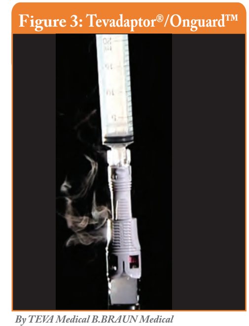
Figure 4: Chemoprotect<sup>®</sup>